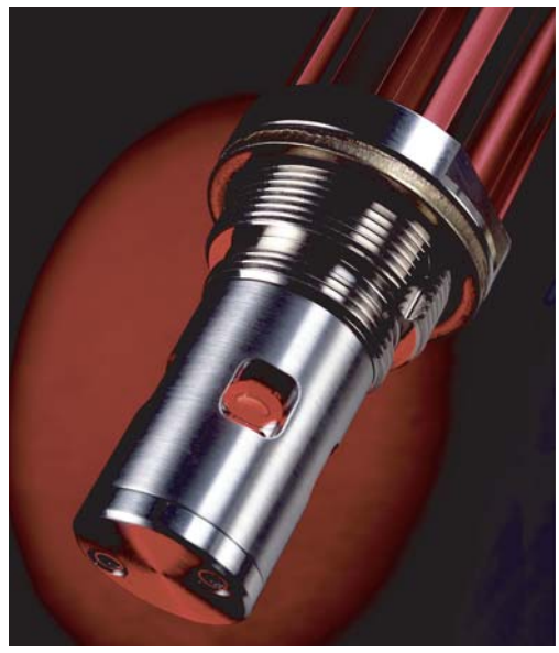
Optional 316 SS sensor housing for applications with high corrosives

A number of different corrosion resistant mirror and sensor housing materials are available, to withstand aggressive sample components in the harshest of applications. High temperature (up to 130°C) and high pressure (up to 250 barg) sensor versions are available. Michell's technical team are always available to advise on the most appropriate choices for your process.